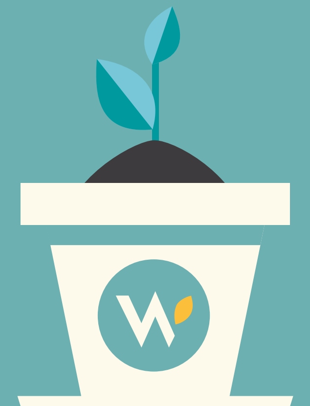
700+ Total kits made7 Sewers and trainers1 Location