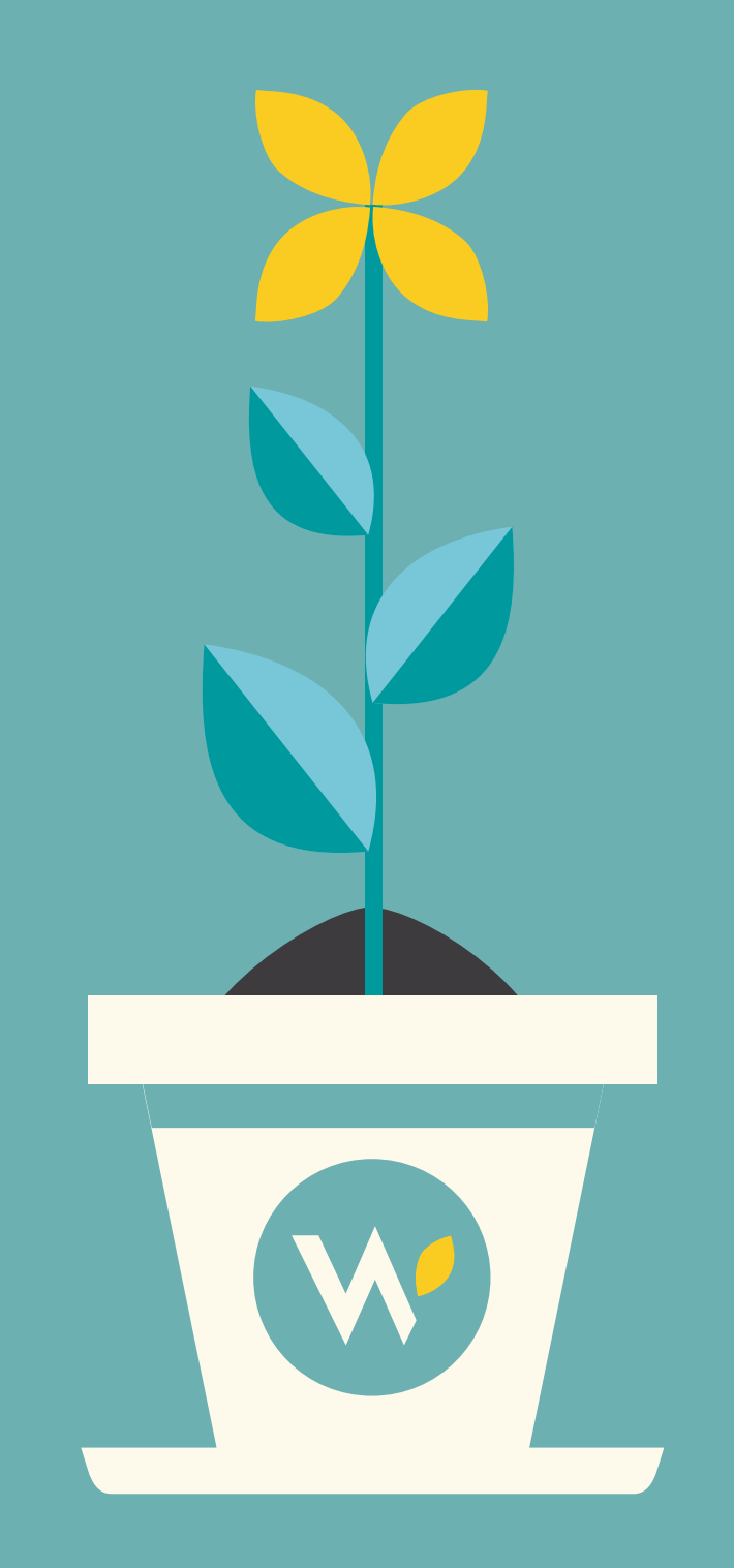
30,000+ Total kits made100 Sewers and trainers10 locations