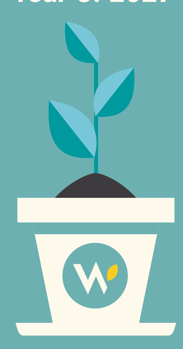
8,000+ Total kits made50 Sewers and trainers4 locations